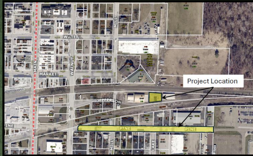
Pine Street Reconstruction