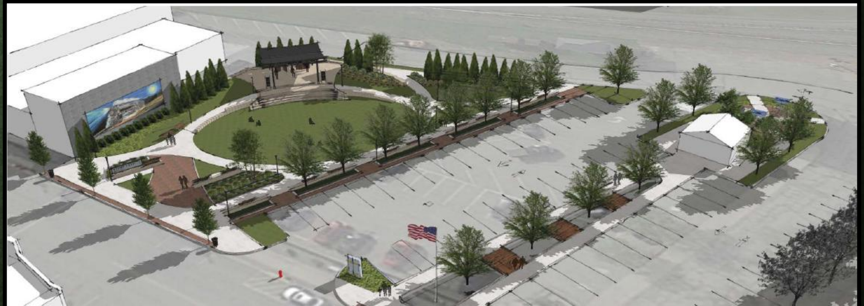
Depot Park Project